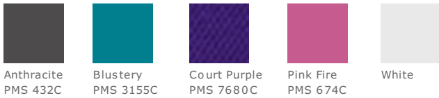
Anthracite PMS 432C